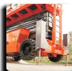
Automatic Leveling Outriggers