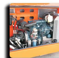
Swing-out Engine Tray